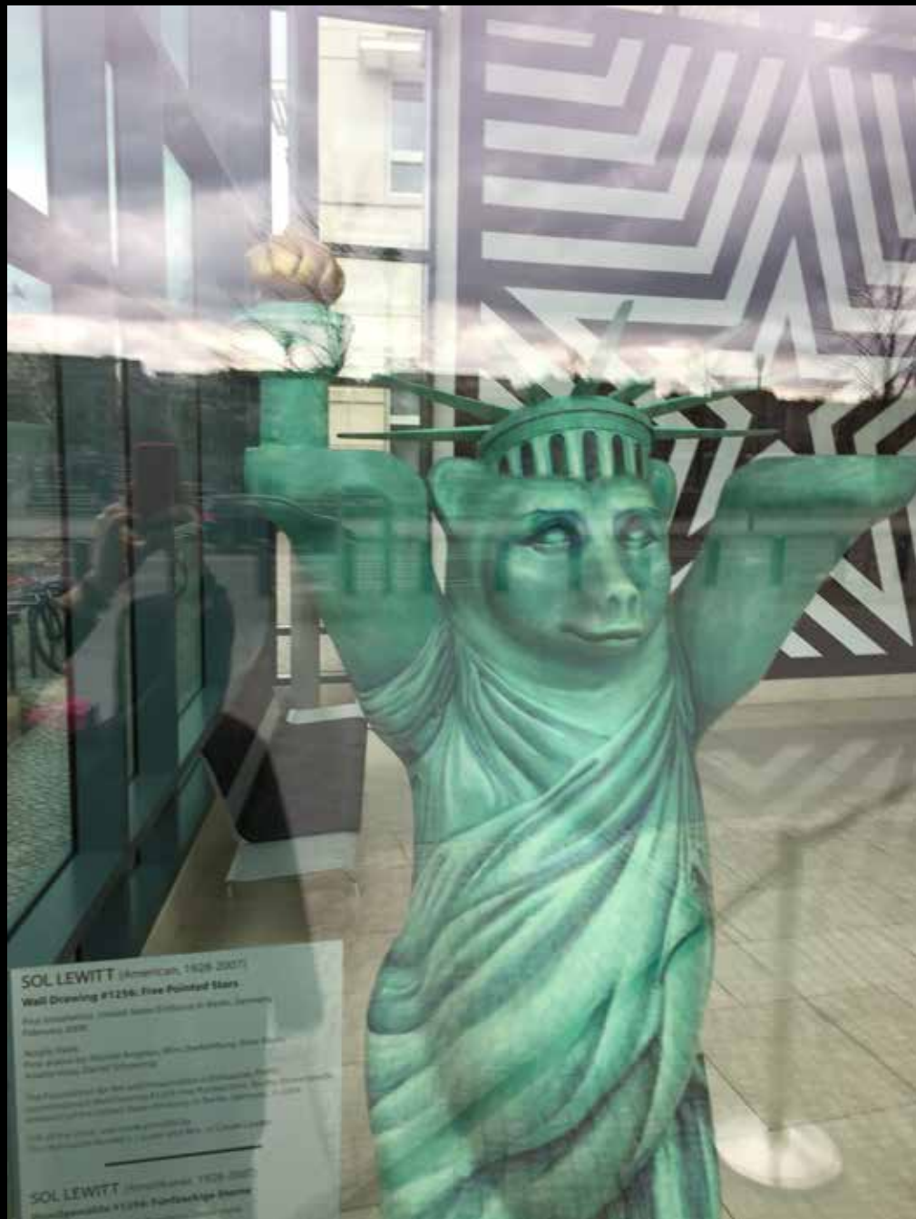
Alex Oberle: This Statue of Liberty Bear was in the window of the U.S. embassy in Berlin.