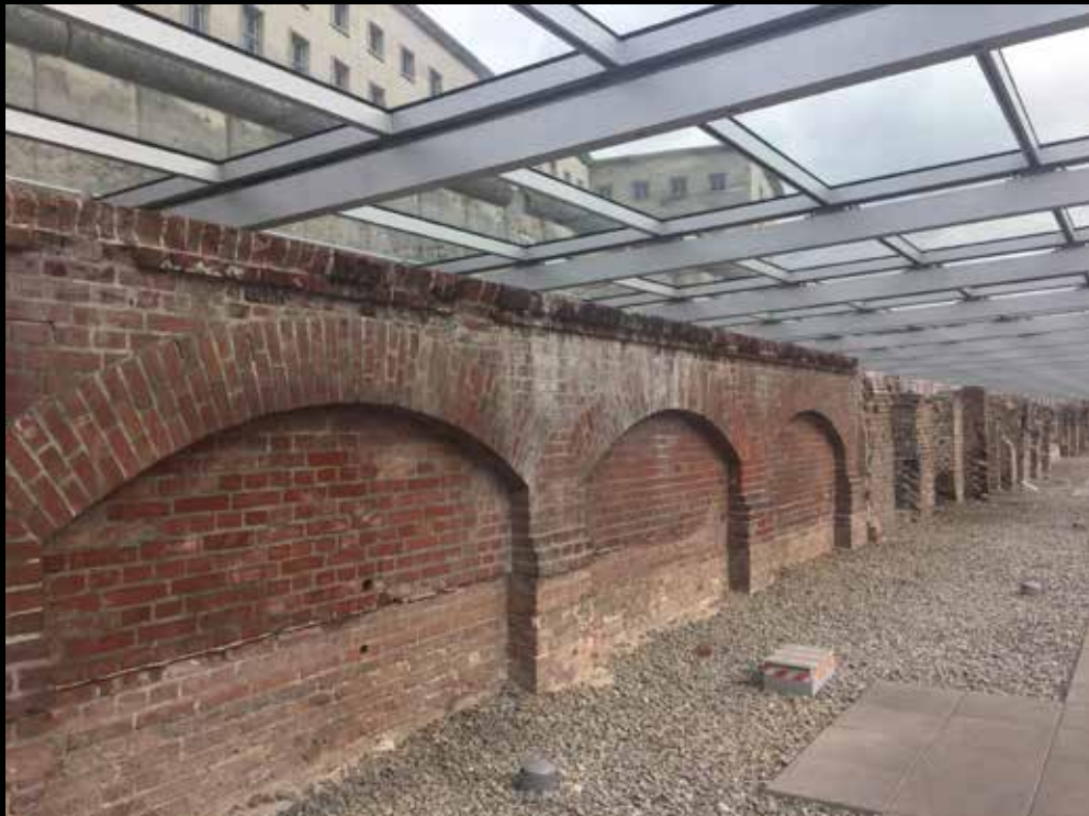
Hoshi Hu: The interrogation rooms below the Berlin Wall.