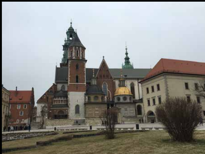
Linda Liu: View at the top of the Wawel Hill grounds. Lots of architectural styles to see when you visit a thousand-year-old site! This is the Gothic Arch Cathedral of Saints Stanislaus and Wenceslaus.