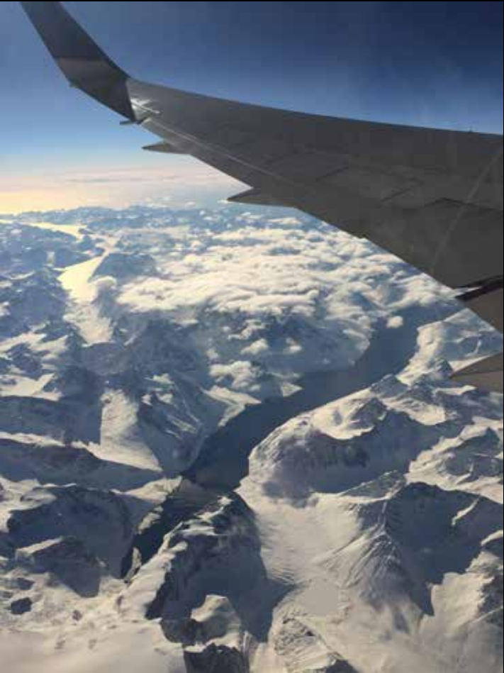
Elizabeth Hansing Moon: On the way home, Roberto noticed we were flying over the southern tip of Greenland! It's not just clouds—it's breathtaking snowscapes!