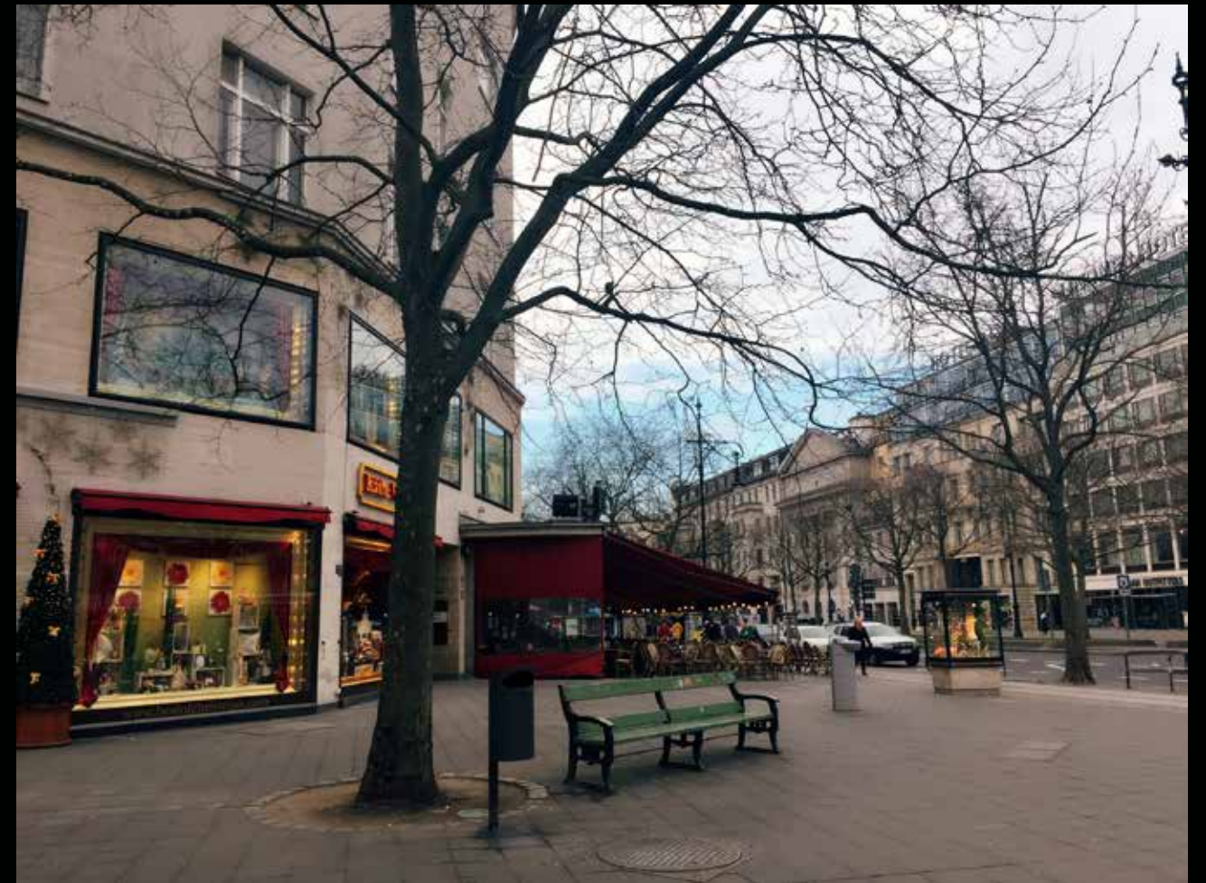
Hoshi Hu: The first day in Berlin, around the corner from our hotel.